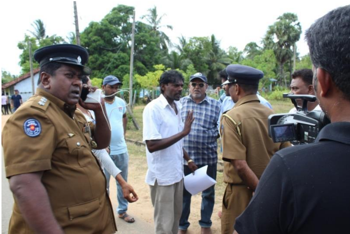
(Image- Police officers are trying to top the protest, Photo Courtesy-Tamil Guardian)