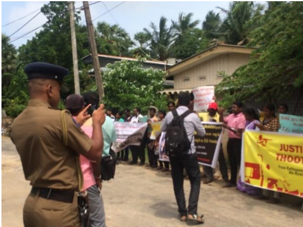
(Image- One police officer is photographing protesters,)

Protesters who were engaged in a protest in front of Consulate General office of India, in Jaffna on 1 st June against shooting of civilians in Thoothukodi, Tamilnadu, India, claimed that they had been photographed unnecessarily by Sri Lankan Police and security guards of Consulate General office 3 .