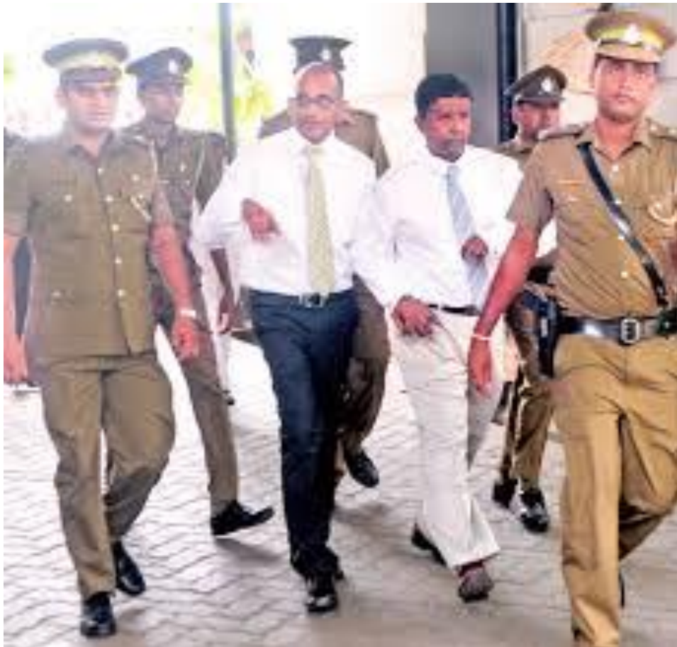
(Image- Arrested offices were taken to remand by prison officers,)