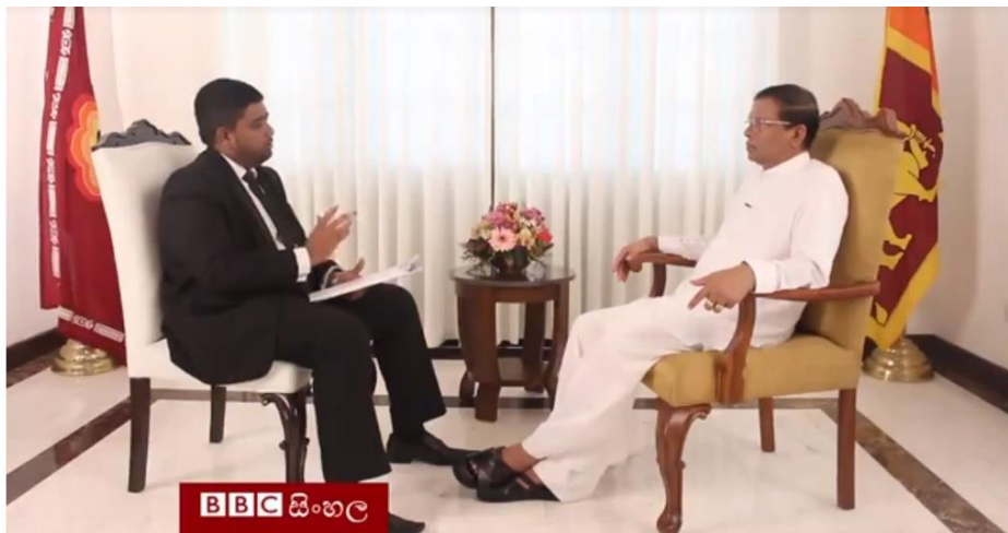
(Image- Azzam Ameen interviewing the President in January 2016)

BBC journalist Azzam Ameen was summoned by the Criminal Investigation Department on 9 th of May to appear before the CID next day to record a statement. Ameen has been summoned to be questioned on his retweet of a tweet from the President’s media division twitter account, The Presidential media division had subsequently removed the tweet and issued a clarification 14 .