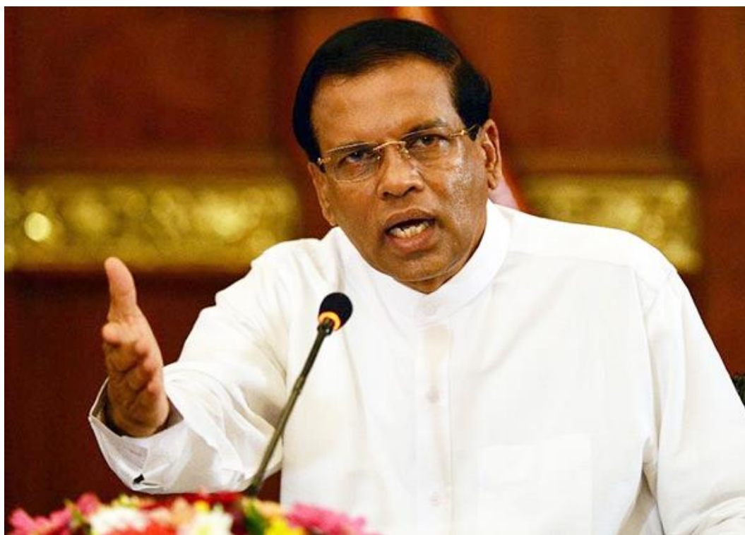
(Image- President Maithripala Sirisena,)

President Mithripala Sirisena was quoted media as saying that he is ready to ban some social media sites if social media were to harm national security, ethnic harmony and integrity of a family. The President had further told that he has already discussed with an American company about controlling and banning social media and he would take steps to control misusing of social media irrespective of whoever opposed 7 8 .