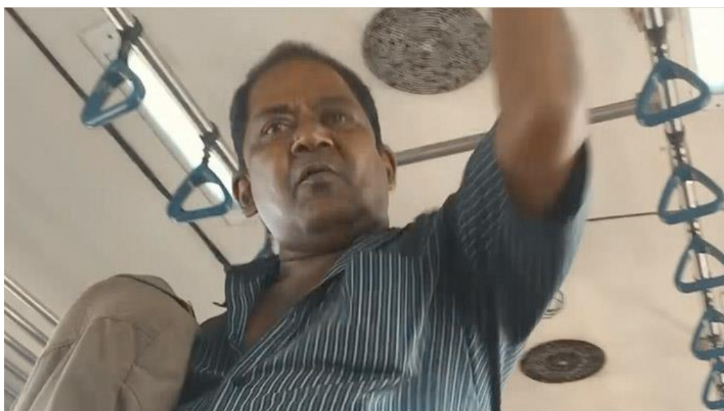
Suspected ticket inspector threatening and making racist comments about the activist and the woman

A ticket inspector of Sri Lankan Railway Department was reported to have sexually harassed a woman and subjected her to racial abuse on a train bound to Jaffna. When an activist / journalist on the train had intervened, the Railway staffer had choked him by gripping his shirt collar and become more aggressive and abusive. The next day, when they tried to lodge a complaint at the Jaffna Police station, they were made to five hours, citing lack of Tamil speaking police officer, though Jaffna is a city where the majority is Tamil speaking. The complaint had reported to have been only accepted after a Tamil Minister had personally intervened with a senior police officer 1 2 .