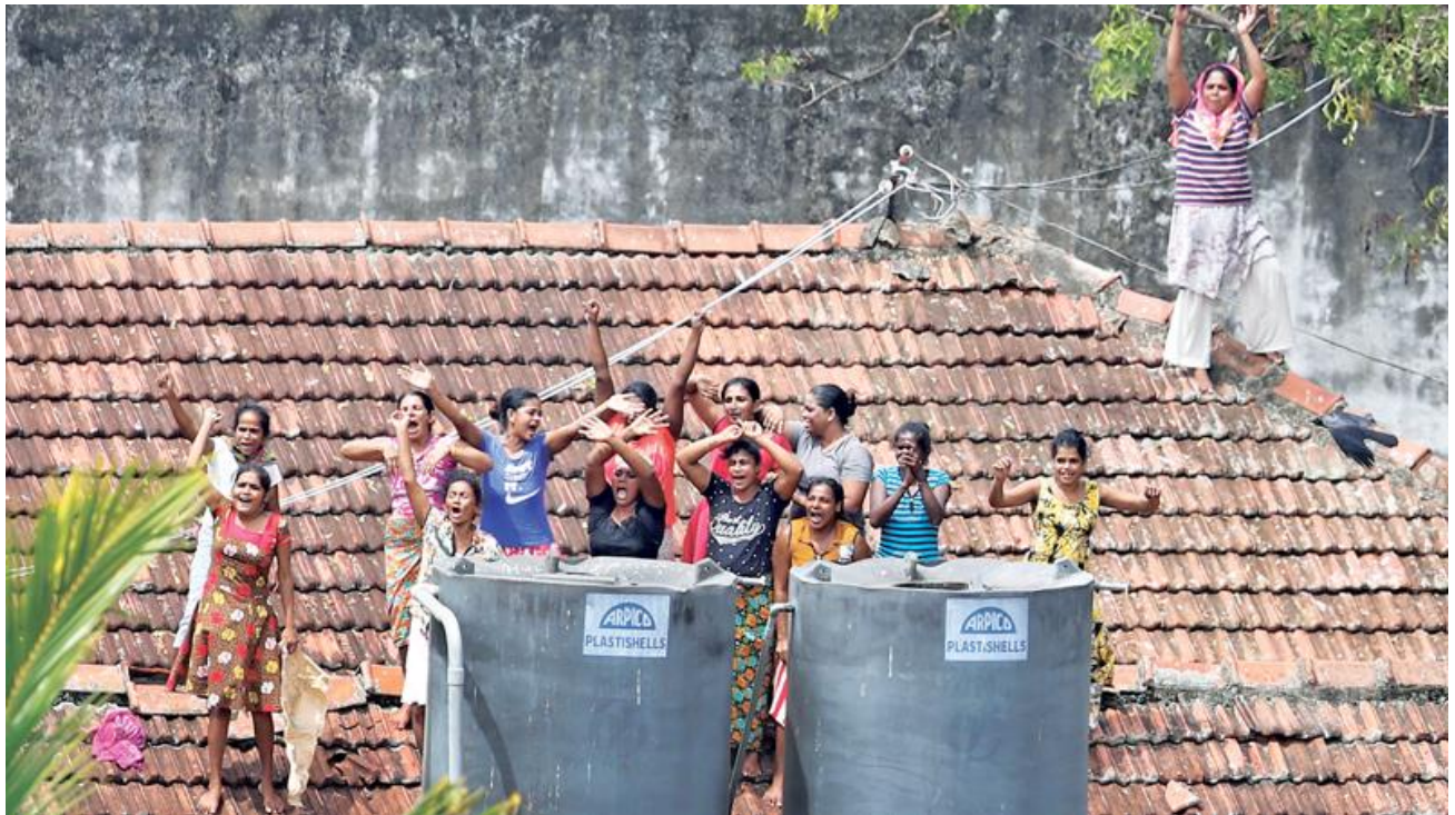
(Protesting female detainees of Welikada Prison in Colombo against lack of facilities and other concerns they had about their rights and wellbeing)

Group of female detainees of Welikada Prison in Colombo were reported to have been brutally attacked by some officers inside the Prison premises and inside a bus while they were taking from Welikada to another prison. The group of female detainees had been protesting for more than two weeks against lack of facilities and other concerns they had about their rights and wellbeing. The protest was dispersed by prison authorities and protesters were reported to have been brutally attacked. After the dispersal, 52 female detainees were transferred to some other prisons from Welikada on 20 th of August, and they had been attacked inside the bus by male prison officers. Mali, a 35 years old female inmate of Welikada Prison, was reported to have died 24 th of August, due to the assault 4142 .