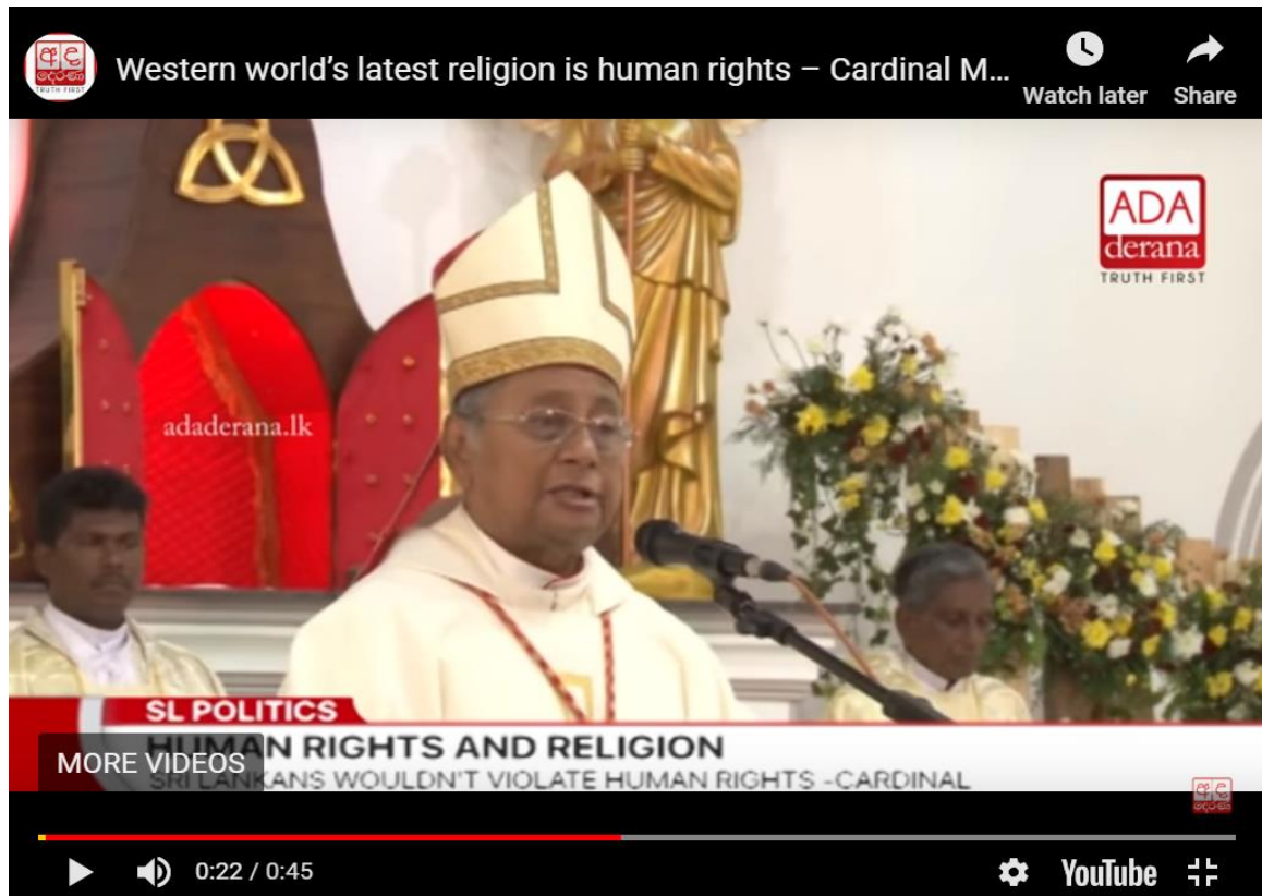
(Image- Cardinal Malcom Ranjith-)

Catholic Archbishop of Colombo, Cardinal Malcolm Ranjith has said that human rights had come recently, that it is a new western religion, meant for those without a religion, a myth to be careful about and that those who believe in religion do not need to talk about human rights 50 . A group of Catholics had publicly challenged his position, highlighting Catholic teachings related to human rights and statements by present and past Popes supporting the human rights framework 51 .