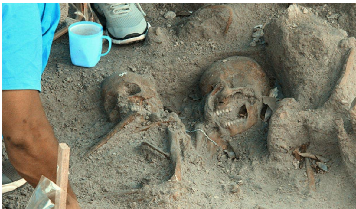
(Mannar mass grave. Image courtesy – Sri Lankan Mirror)