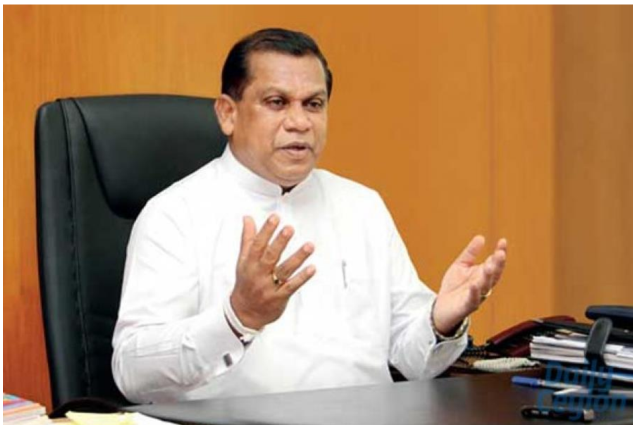
(Image- Minister Ranjith Madduma Bandara )

Law and Order Minister Ranjith Maddumaandara is reported to have blamed to Tamil Cinema for promoting violence in North especially among the youth groups. He described in Colombo on 13 th of July that a 'fact finding mission' in Jaffna, found that Tamil films was fuelling the gang violence in Jaffna. Tamil youths were emulating the violent scenes to instill fear before carrying out their criminal activities such as robberies." 28,29