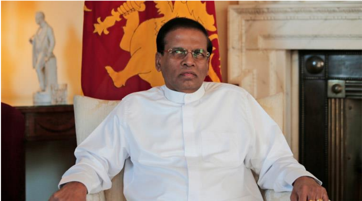
(President Maithreepala Sirisena)

President Maithreepala Sirisena was reported to have blamed social media for increasing murder, rape and drugs. “Some social websites and use of illegal drugs have caused an increase in murders and rapes, there is the responsibility of the government as well as the parents to give priority to save children from these evils” President Sirisena was reported to have said at a public event in Kandy on 11 th July 24 .