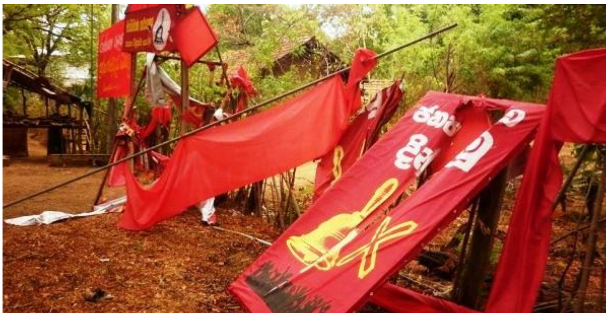
Dozens of JVP campaign offices have been attacked and destroyed

The Uva Provincial Council election was held on 20th September 2014. According to various reports more than 50 opposition campaign party offices were attacked and destroyed. "Opposition offices were set on