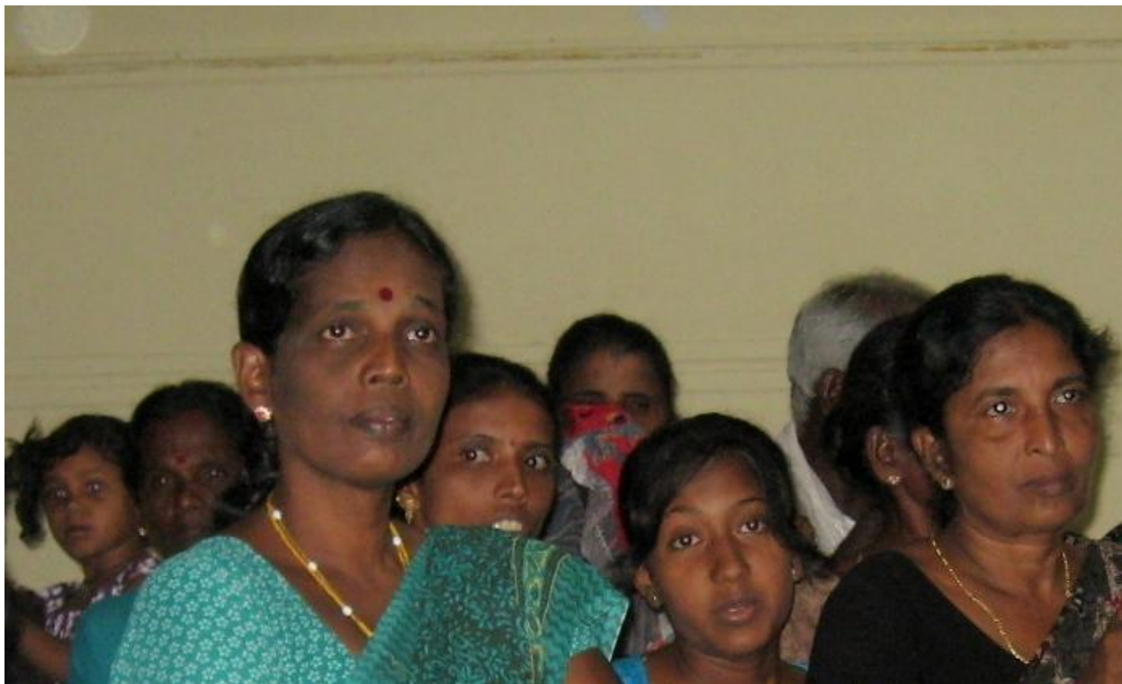
Tamil participants from the North were made helpless by the Monks led mob

A mother of the disappeared had complained that on the 3rd of August, she had received a threatening phone call from an unidentified person, who had told her that they (the caller) knew she was going to Colombo for a meeting. Some of the other mothers too had received similar calls from unidentified persons in the days prior to the meeting, and sometimes from callers claiming to be from the Criminal Investigation Division (CID), inquiring after their whereabouts, and insisting that they come meet with the caller at a said location. Another mother of a disappeared person had CID officers standing outside her house a few days before the meeting, and they had threatened her before she left for Colombo. She had also received similar calls from unidentified persons in the days prior to the meeting. One of the Northern based organizers of the event had received a threatening phone call from an unidentified person, also on 3rd August, asking if he was taking families of the disappeared to Colombo that night (3rd) for a meeting. Another mother complained that whilst she was in Colombo on the 4th, the CID had visited her home in the North and asked after her whereabouts. These mothers have been getting such anonymous calls for at least a month preceding this meeting.