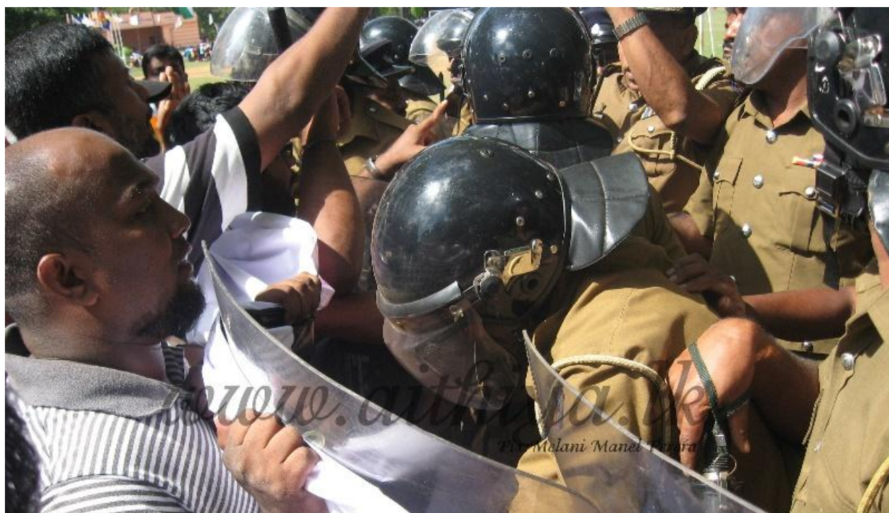
Police blocked peaceful campaigners on 30th Aug 2014

http://tamilnet.com/art.html?catid=13&artid=37363 (Last accessed on 14 th Sep 2014)