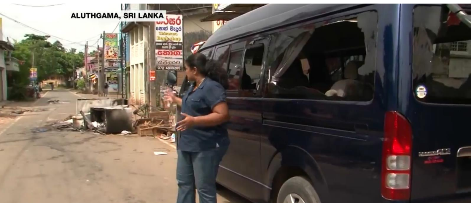
Al Jazeera Colombo correspondent, standing in front of the damaged vehicle, explains how their media team came under attack from an unruly mob while covering the aftermaths of communal violence in Aluthgama, Sri Lanka