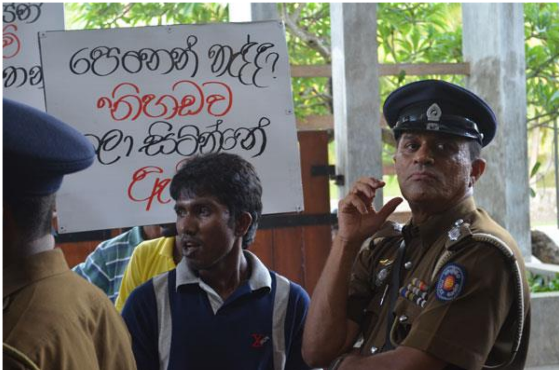
Member of the mob that invaded TISL media training in Negambo shouting at the journalists while a senior police officer stands in front to protect the mob

A training workshop for Tamil journalists by the Transparency International Sri Lanka (TISL) at the Gold Sands Hotel, Negombo (Western Province) was disrupted by an organized group of protesters who had arrived outside the premise on 7 th June. The protesters had accused the TISL of supporting terrorists and claimed that the workshop was to train people to give evidence against Sri Lanka in an international investigation. Despite the emphasis by TISL representatives that this workshop is legal and not something against the country, the police had not taken any action to disperse the protestors and instead ordered to stop the workshop.