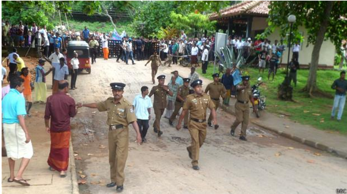
Mobs supported by the ruling party politicians gathered at the gates of University of Ruhuna threatening students and lectures