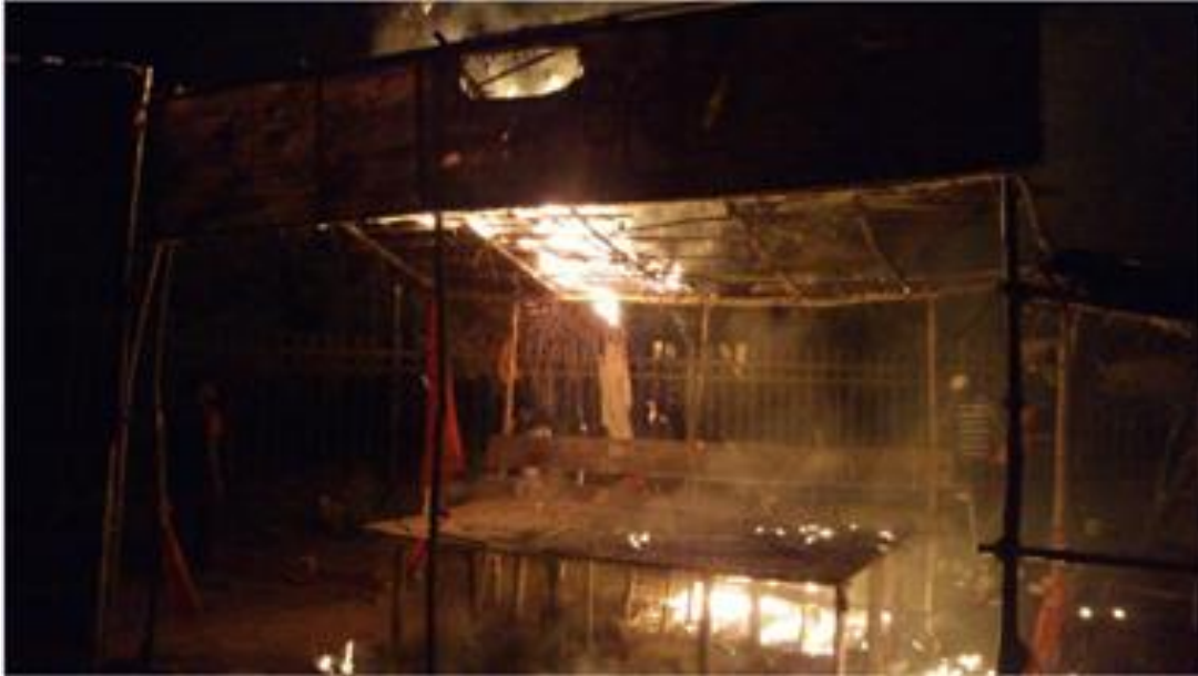
The burned hut of student activists

the early hours of the morning. One student was injured in the incident. According to “Students for Human Rights”, no action has been taken by the police despite complaints being made.