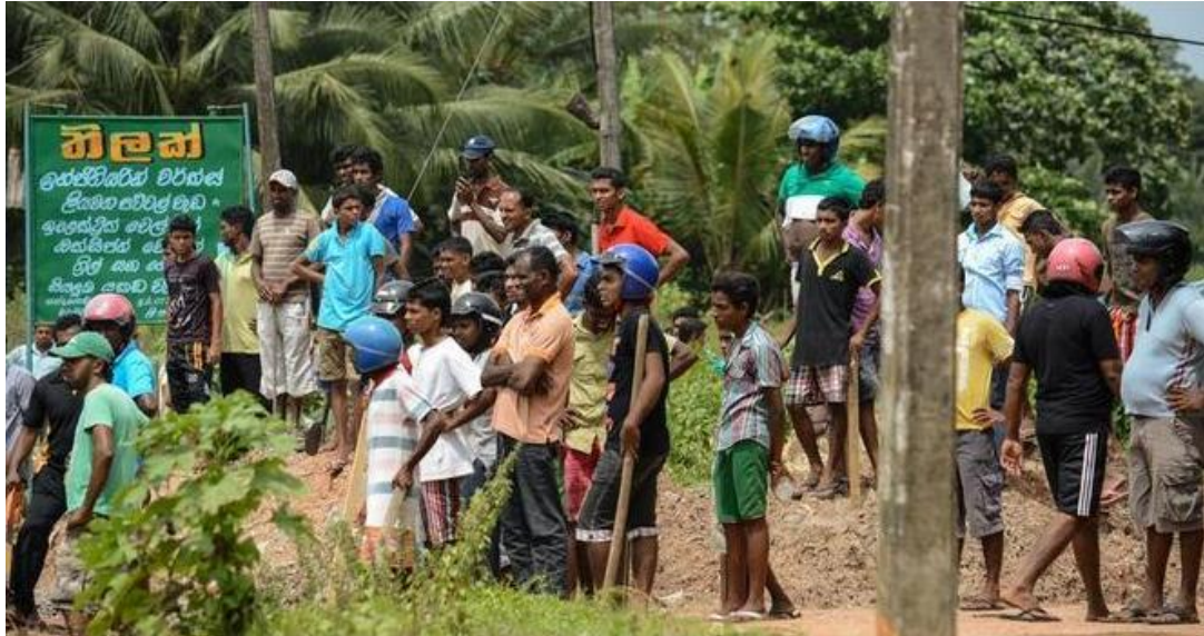
Despite a military imposed curfew in the town of Aluthgama, crowds supporting the Bodu Bala Sena continued to line the streets accusing the armed forces of protecting Muslims

Leader of the opposition, Mr. Ranil Wicramasinghe had stated that a censoring letter had been sent to every media organization following the Aluthgama and Beruwala communal violence which took place on 15 and 16 th of June. The letter had allegedly instructed the media organizations to do as told or suffer the consequences such as legal action and the revoking of licenses to electronic media, Mr. Wicramasinghe stated 1 .