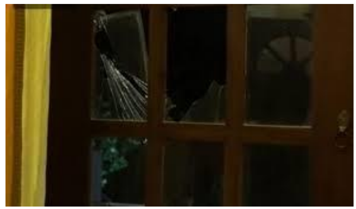
Broken window of Veteran Journalist Chamuditha Samarawickrama's residence.