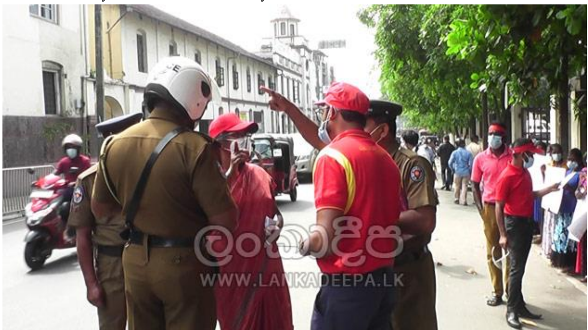
Police obstructing the protest of Ceylon Worker's Red Flag Union.

Police dispersed the protest conducted by the Ceylon Workers' Red Flag Union in front of the labour department kandy. The Police claimed that the protest allegedly disturbed the Advanced level students examination. The protestors demanded a 1000 Rupees salary increment for the plantation workers that the plantation owners had promised at the wages board and signed a collective agreement with trade unions which they had withdrawn unilaterally.<sup>36</sup>