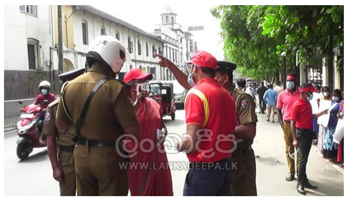
Police obstructing the protest of Ceylon Worker's Red Flag Union.