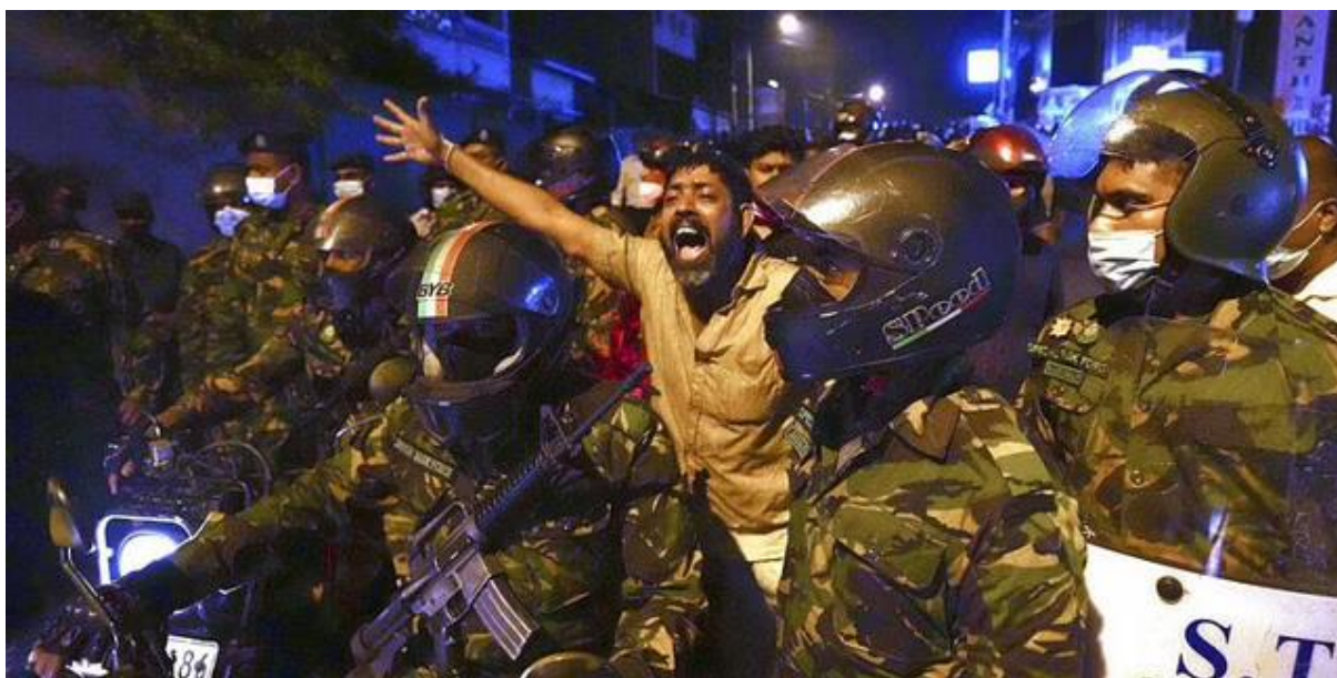
A protestor shouts anti-government slogans during a protest outside Sri Lankan president's private residence in Mirihana on the outskirts of Colombo, Sri Lanka