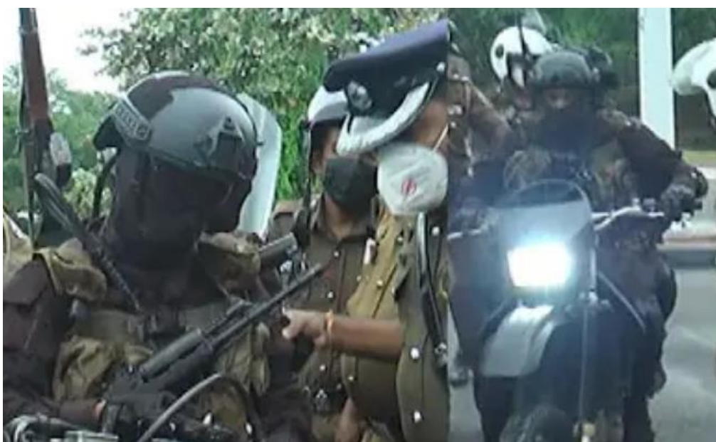
Police officers stopped and questioned the masked military men intimidating the protestors.

On 5 th April 2022, six armed military personnel travelling on unregistered motorbikes attempted to disrupt and intimidate the peaceful protest held near the Parliament roundabout. The police officers who were stationed to guard the entrance of the parliament to prevent the protesters from entering the parliament premises stopped these army riders who were wearing facemasks and riding motorcycles with no vehicle registration numbers, while also carrying weapons. While the army commander issued a statement demanding an inquiry into the matter, police in a statement said they will conduct an impartial inquiry regarding the incident. 56 57