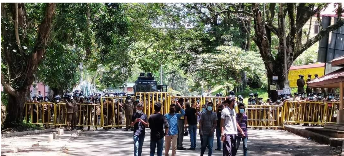
Police put barriers and brought the water cannon truck to obstruct the Peradeniya University Student Protest.

Students of University of Peradeniya despite the curfew and emergency law have organised a protest demanding solutions to the current economic crisis and other issues such as not paying Mahapola scholarship to the students on time. 31 University students accompanied their university lecturers and marched the protest from university to the Kandy town. By the Galaha junction police have obstructed the protest by setting up the barricades. When students started to push off the barricades, a tense situation arose and police started to fire tear gas and water at the protestors. Following the tense situation students sat down on the road as a mark of protest. Peradeniya Teaching Hospital staff also joined and supported the protest. 32