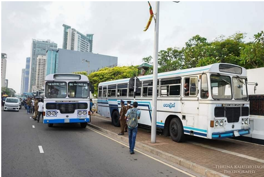
Police buses are parked on the pavement of the temple trees.

The tense situation occurred on 29 th April 2022 when police attempted to remove the banners and posters that had been placed on the Police bus that was continuously parked blocking the pavement to enter the Temple trees. The one protester was injured and hospitalized. The anti government protesters near the temple trees claimed that a Senior Superintendent of Police (SSP) was present when the incident occurred. The police have forcefully parked the buses and trucks blocking the pavement in front of Temple trees where protestors were protesting. Group of Lawyers lodged a complaint to Colpety police about parked police buses and trucks that blocked the pavement and loudly playing recordings of Buddhist pirith causing inconvenience to the public. 44