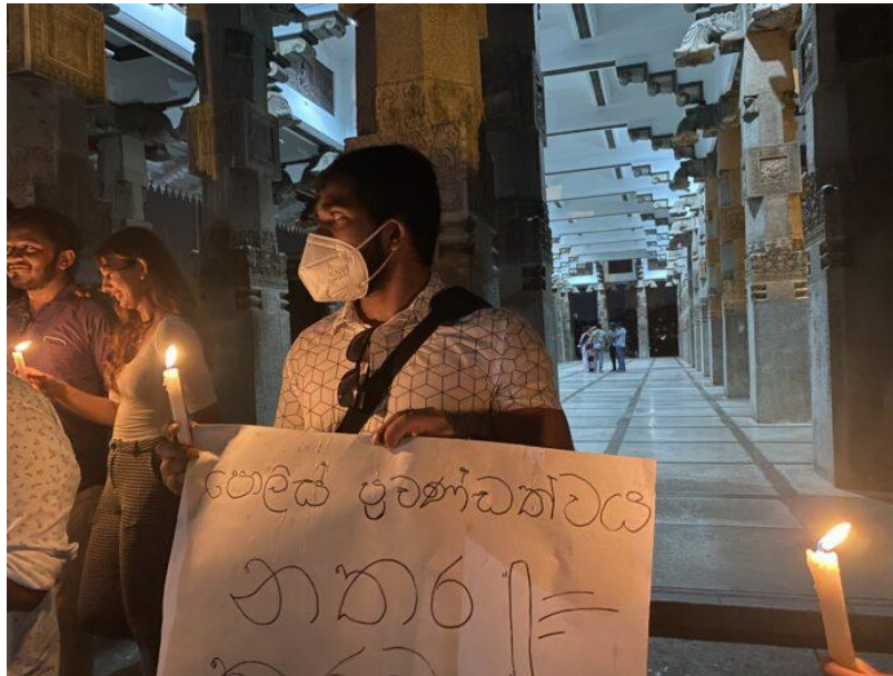
Candlelight vigil staged at Independence Square

of the candlelight vigil participants. Candlelight vigil and pro-government protest both happened in the Independence Square, 39