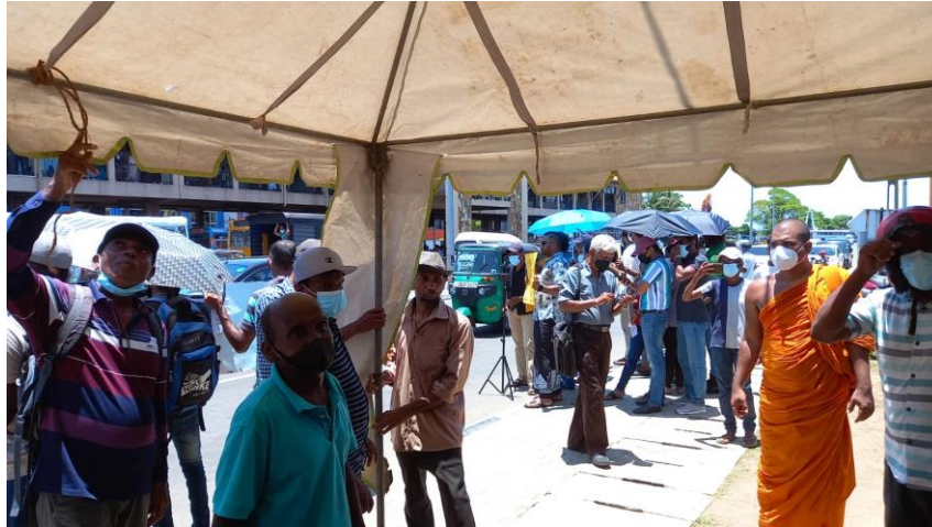
Replacing the removed tent at Gota Go Village galle Branch.

complaint or court order police have removed the tents. After lawyers intervened tents were restored. 35