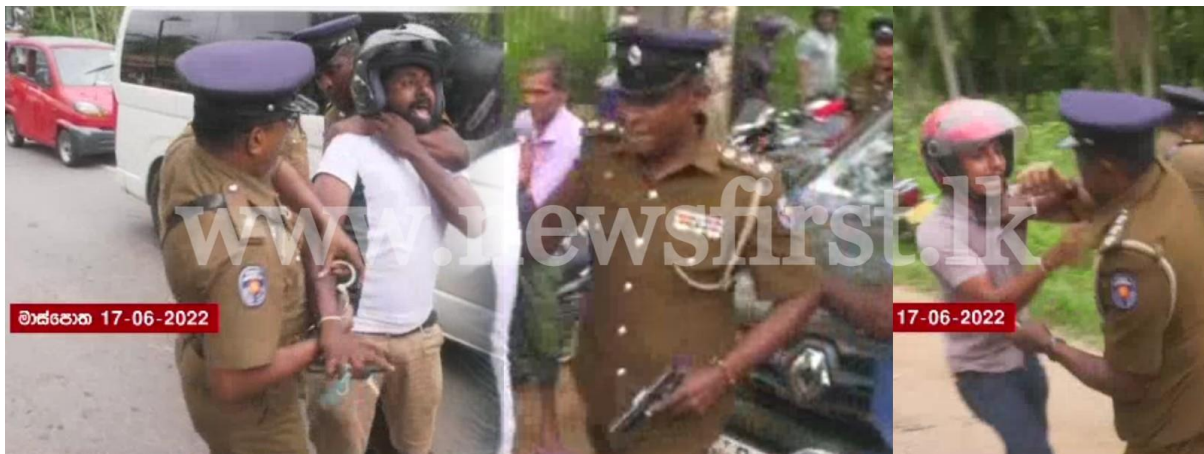
On 17th June, pistol-wielding police officer verbally and physically abused, assaulted and handcuffed several motorists waiting at a fuel station in Maspotha, Kurunegala who protested accusing that the fuel station had not issued its full stocks to the public.