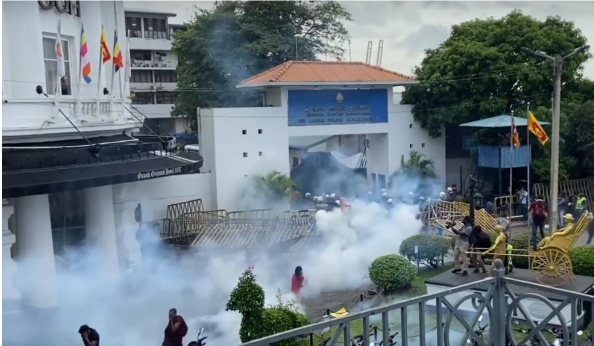
The protestors were tear gassed at the entrance of the Police Headquarters building in Colombo. Video: Newscutter

Police fired tear gas and water to disperse the protestors near the police headquarters on 09 th June 2022. The protest commenced from near Fort Railway Station and marched towards the police headquarters when Police fired tear gas. 58 59 They protested demanding justice for the May 09 th attack on peaceful protest sites in the Galleface and near the Temple Trees. 60