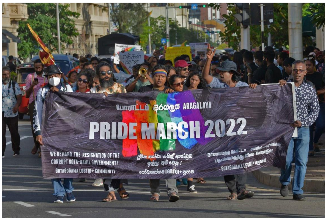
Aragaya Pride March in Colombo.

Pride Celebrations: Sri Lanka's first pride marches were held on 11 th of June in Jaffna and 25 th of June in Colombo for the first time in Sri Lanka. The Colombo Pride March was organised by the LGBTIQ+ activists who were part of the anti-government protests in Colombo, demanding the resignation of the ruling government. 6