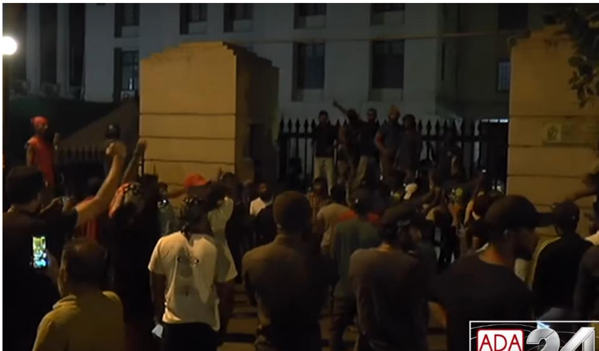
Protest blocking the entrances of the Finance Ministry started the previous night.

Twenty one persons including a Buddhist monk were arrested by the Police and Special Task Force for blocking the entrances of the Finance Ministry and the Presidential Secretariat in Colombo on 20 th June 2022. The protest started from the previous night. 56 Police claimed the protesters continued to engage in protest blocking both entrances using the temporary tents that had interrupted a meeting to be held with the officials of the International Monetary Fund (IMF). The IMF official meeting was held at the Prime Minister's office and the Secretary to the Finance Ministry had to be escorted out of the Ministry building to attend the meeting as the protesters have been blocking both the entrance and the exit of the Ministry. Police further said 4 women were also among the arrested protesters. 57