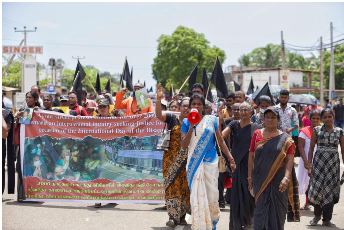
A protest was held in Mullaitivu remembering the International Day of the Disappeared.

13 Members of Parliament who were part of the Sri Lanka Podujana Peramuna (SLPP) informed that they have decided to sit independently in Parliament. 2