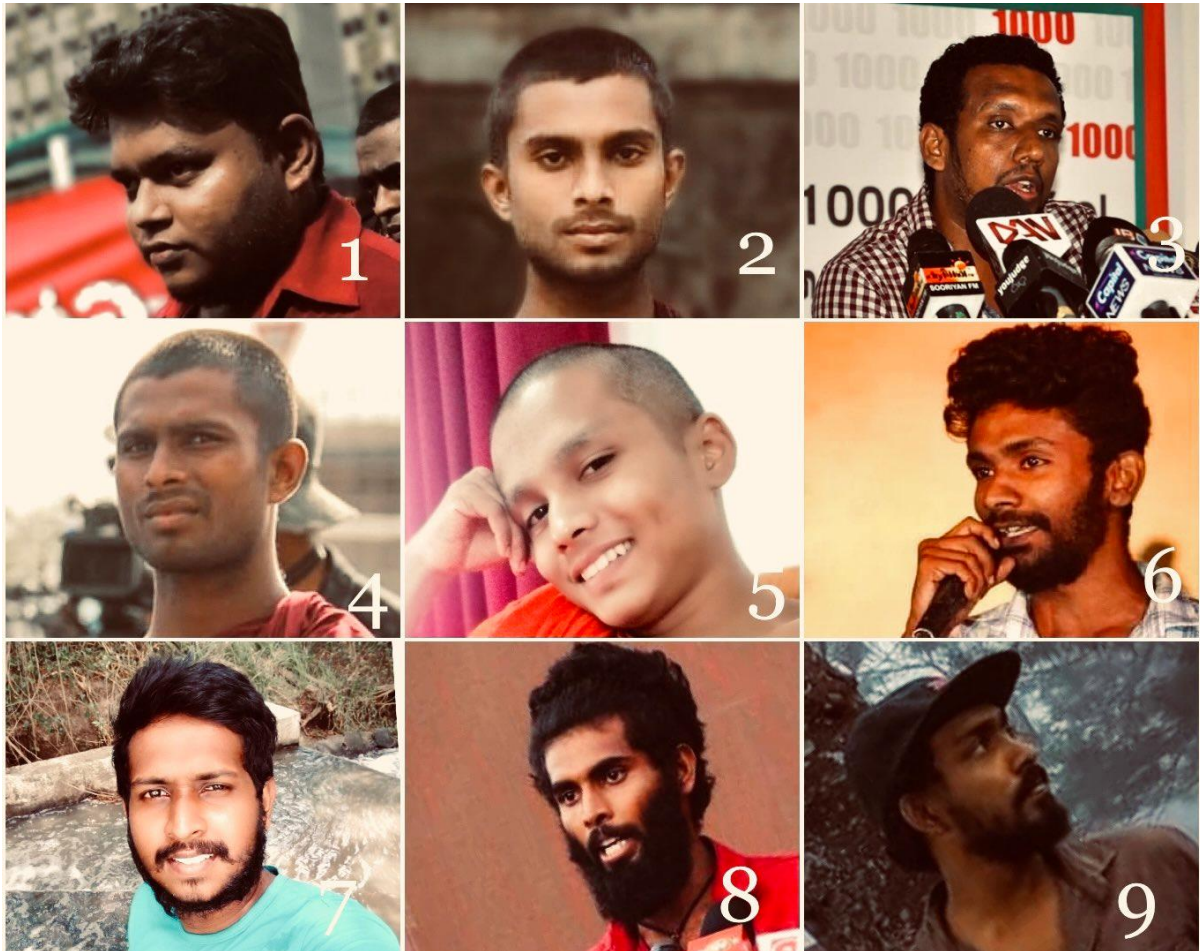
At least 21 activists including the convener of the Inter University Student Federation were arrested by police on 18th August 2022