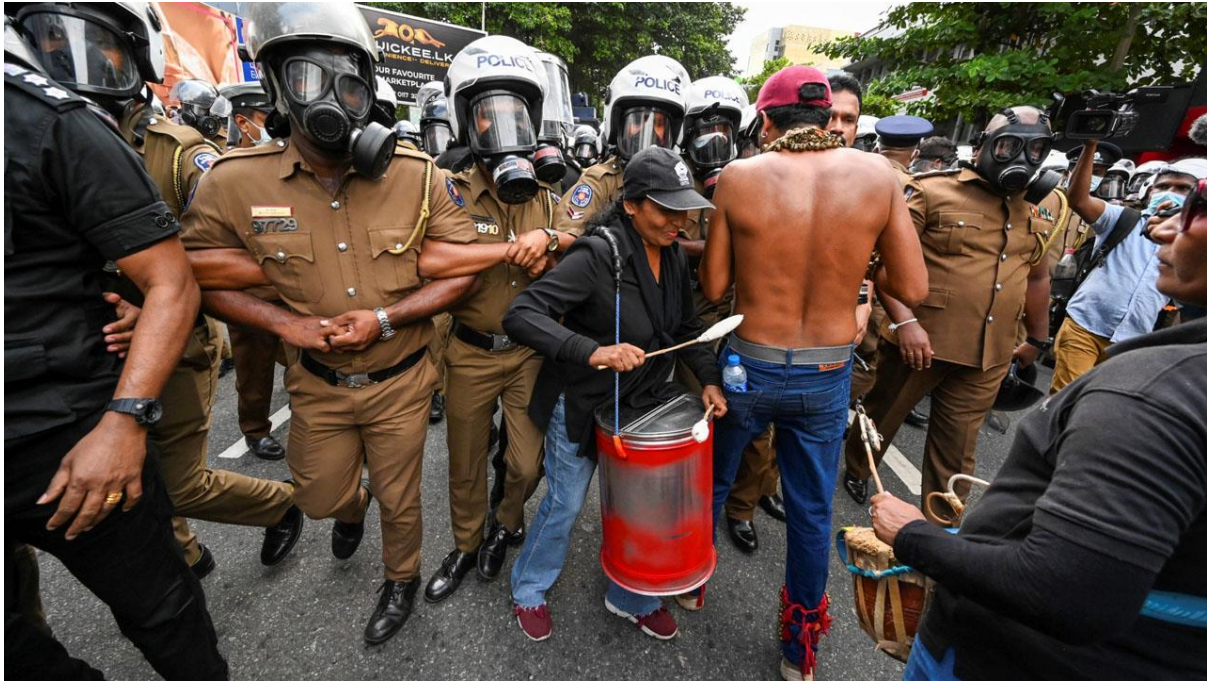
Policemen try to block during the protest held in Colombo on August 18, 2022.