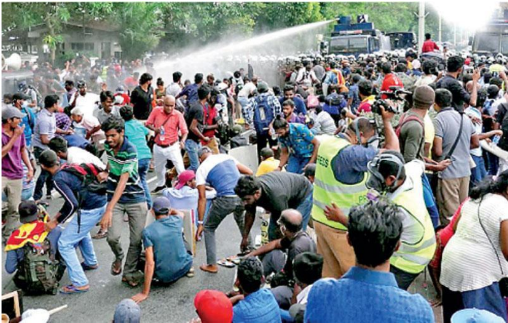
Police firing tear gas at the protesters.

On 30th August, Inter University Student Federation (IUSF) organized another protest in Colombo, demanding the release of three PTA detainees including arrested student activists. It was blocked and dispersed with tear gas and water cannon attack on Deans Road, Maradana. Close to about 1,000 police personnel including the Special Task Force (STF) and the Riot Control Units backed by several water cannon trucks attacked the protesters who sat down on the tarmac road near the Ministry of Health with rounds of tear gas being fired into the air. The fleeing students were chased after by the advancing police forces up to the Technical Junction where the group then scattered. Also, over 27 protesters were arrested by the police. 58