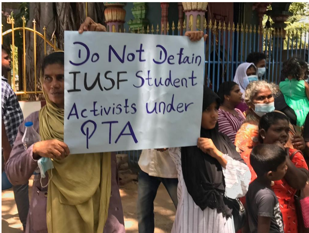
Protests were organized in Colombo, and North and East demanding the release of student activists under prevention of Terrorism Act.

HRCSL writes to IGP on arrest of protesters using PTA: On 22nd August, HRCSL wrote a letter to the IGP on the arrest of protesters using Prevention of Terrorism Act. The letter said that PTA has been grossly manipulated, and undemocratically used to justify wrongful arrests of the protesters. Commission said they are deeply concerned about the use of PTA to arrest suspects that do not fall within the definition of the act, and informed IGP to inform them the facts and circumstances under which these suspects have been dealt with under the PTA. It further said “the reports received by the Commission so far only reiterate that these persons now arrested and detained by the police under PTA were merely exercising their fundamental rights of protest.” Also, they pointed out that offences such as harming to government property could not be used as a justification to arrest protesters under the PTA, as PTA is a special law that deals with acts of terrorism. 32