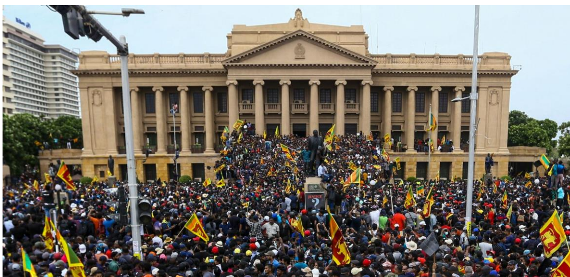
Anti-government protesters gather outside the presidential palace in Colombo, Sri Lanka, on July 9, 2022.

On 19th August Police issued a press release seeking public assistance in identifying 72 protesters who allegedly “forcibly entered the Presidential Secretariat President’s in Colombo on 09 July and damaged its property”. 43 44 In the statement, the Police Media Division said the Colombo North Division criminal investigations unit is carrying out investigations to arrest suspects in connection with the incident. The police also published photographs seeking information about 34 suspects who have been identified through social media networks but whose identities have not been confirmed so far. Police also sought public support to arrest those who sat in the President’s chair. 45 A young man and two women who sat on the President’s chair were subsequently arrested later. 46 47