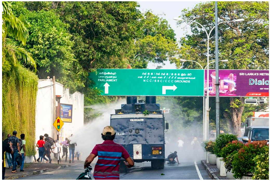
Police attacked with teargas and water cannons at protesting students in Colombo