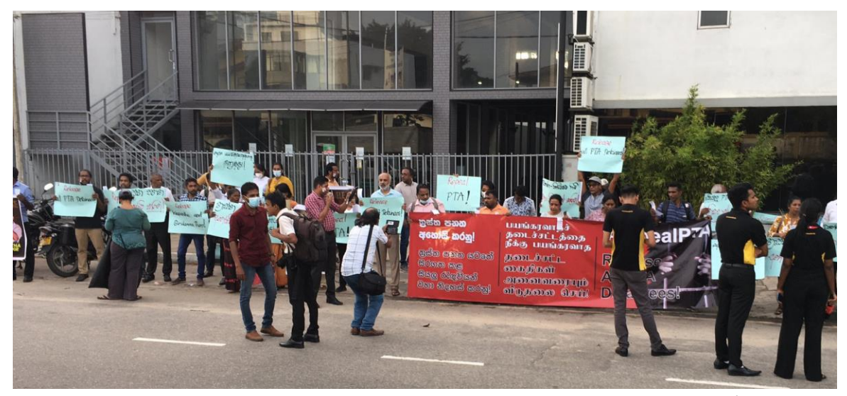
The protest held near the Terrorism Investigation Division.

allegedly informed the demonstrators that they cannot use megaphones as their use in protests has been banned. 44