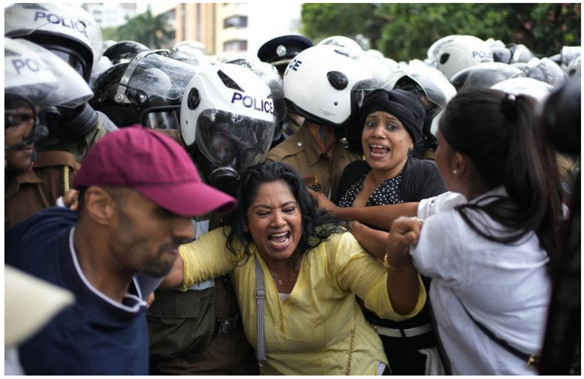
Anti government protesters scuffle with police officers as police block their protest march in Colombo