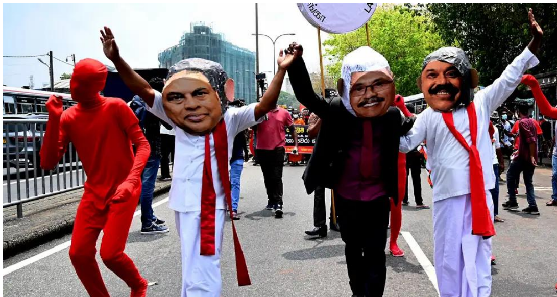
Last year, various protests were organised calling for the resignation of President Gotabaya Rajapaksa and his relatives in government. March 2022, Colombo.

The Supreme Court on 14th November gave a landmark judgement that the public trust and Right to Equality before law under the Constitution had been violated by leading the country's economy to a crisis due to the lack of proper management of the economy by former President