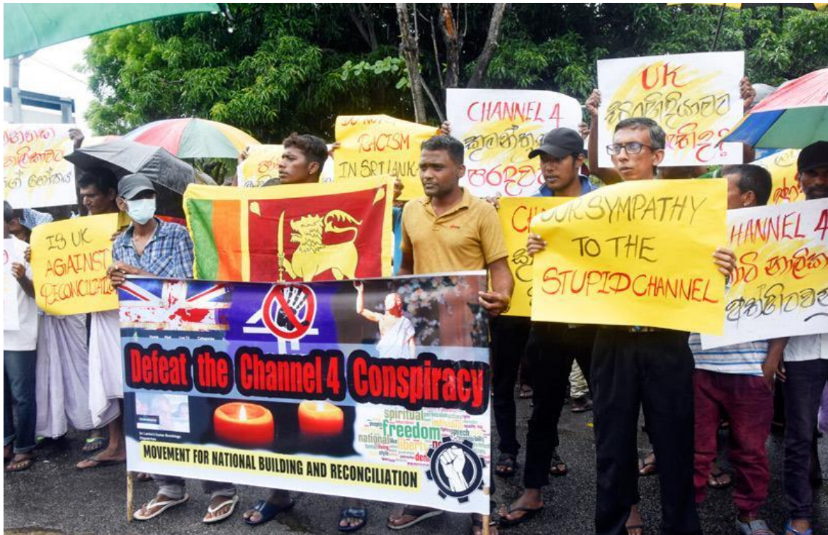
A Sinhala Buddhist Nationalist group in Colombo organized a protest in front of the British High Commission of Sri Lanka, calling the Channel 4 documentary a conspiracy.