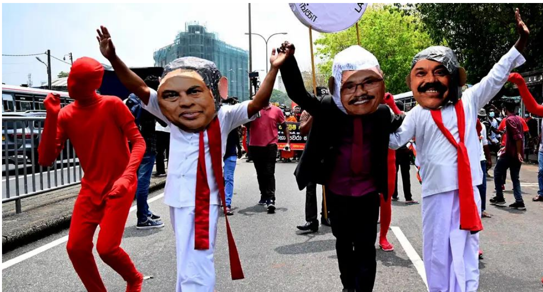
Last year, various protests were organised calling for the resignation of President Gotabaya Rajapaksa and his relatives in government. March 2022, Colombo.

The Supreme Court on 14th November gave a landmark judgement that the public trust and Right to Equality before law under the Constitution had been violated by leading the country's economy to a crisis due to the lack of proper management of the economy by former President