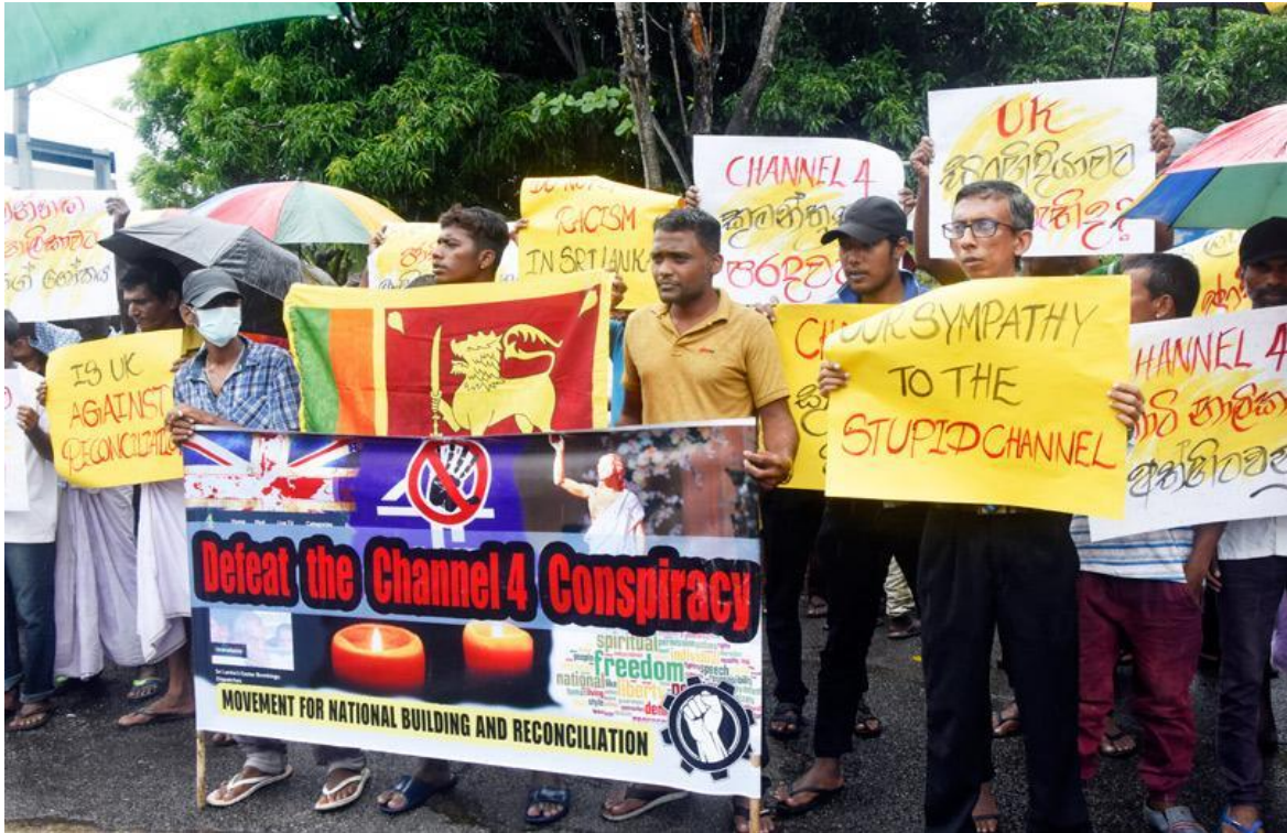
A Sinhala Buddhist Nationalist group in Colombo organized a protest in front of the British High Commission of Sri Lanka, calling the Channel 4 documentary a conspiracy.