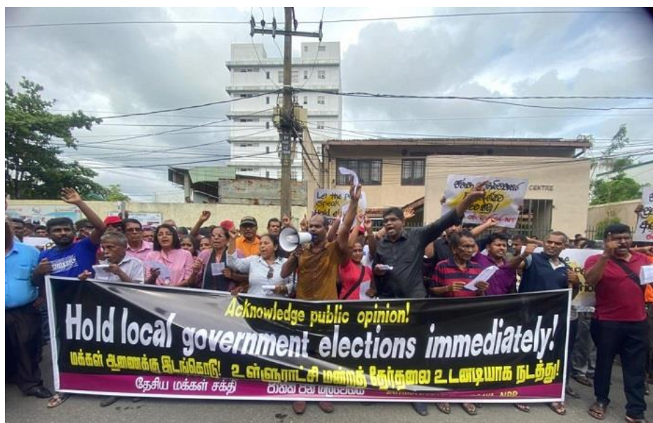
Local government elections have been delayed for almost two years. A political party protesting in front of the National Election Commission in June 2023, Colombo Sri Lanka.

Budget 2024: While Sri Lanka was expected to meet certain economic targets and indicators by December 2023, to receive the second instalment of the loan provided under the IMF extended fund facility, 1 2 President Wickramasinghe presented the next year's annual government budget to the Parliament. Value Added Tax (VAT) was increased from 15% to 18%, and 97 items out of 138 goods were removed from VAT exemptions. Other measures to collect income tax were also introduced. The government said it expects inflation to increase by 2.5%. 3 4 Taking these measures could be much challenging to the government as national elections are planned to happen in the coming year.