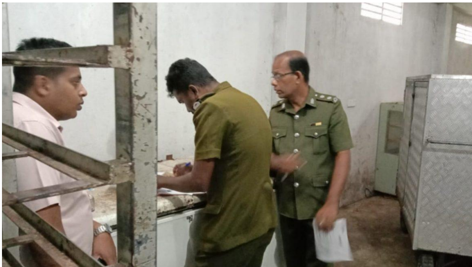
PHI raided and seal the hotel cooling room the Avenra Garden Hotel Negombo.